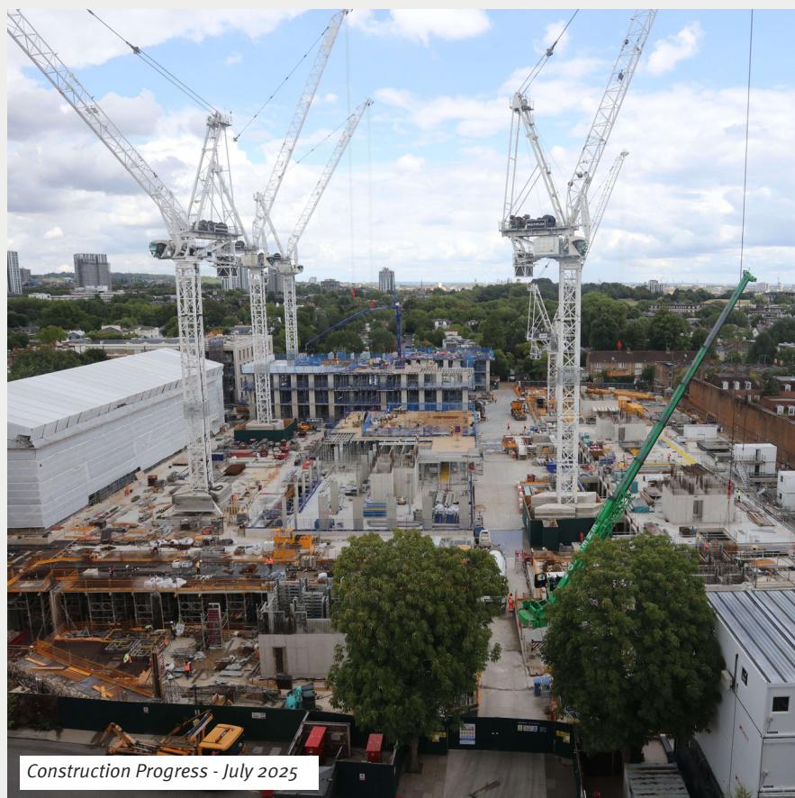
Construction Progress - July 2025