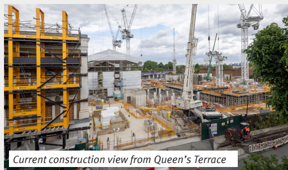
Current construction view from Queen's Terrace

The Riding School: Restoration of the roof and building fabric is ongoing and the scaffolding is expected to be removed towards the end of the year.